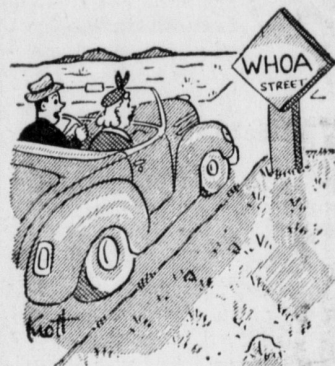
"Apparently the horses can read here in Texas."

Two breakfast prayer meetings will proceed the beginning of the evangelistic crusade of 4 local churches. Wednesday, Jan. 26, and Wednesday, Feb. 2, are the dates for the meetings at 8:30 a.m. in the annex of the Evangelical Cong. Church and 7:30 p.m., Methodist Church — Jan. 26 and Evangelical, Feb. 2. The combined services of the Methodist, Evangelical Congregational, Church of God and St. Mark's E.U.B. will begin in the E. U. B. Church Sunday evening, Feb. 6.