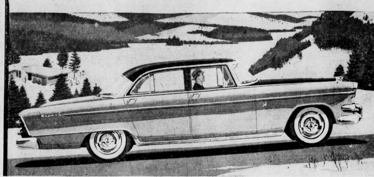
New Dodge Custom Royal V-8 4-door Sedan