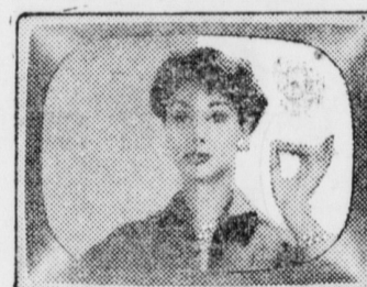
NEW "ALL-CLEAR" PICTURE — 212% greater picture contrast with aluminumized tube and dark-tone safety glass.