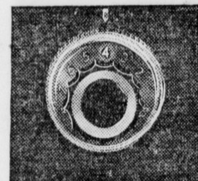
NEW "EASY-SEE" VHF DIAL — 59% greater readability. Slanted king-size numbers!