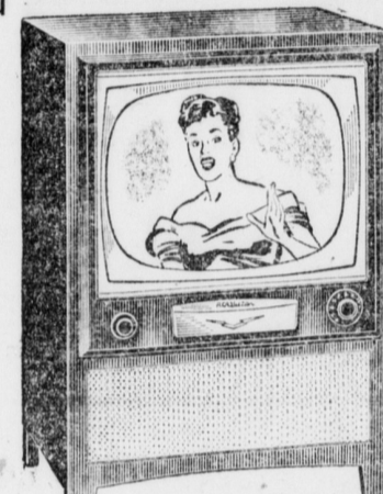
RCA Victor 21-inch Traffon . Grained finishes, mahogany, lined oak extra. Model 215518.

Ask about the exclusive RCA Victor Factory-Service Contract