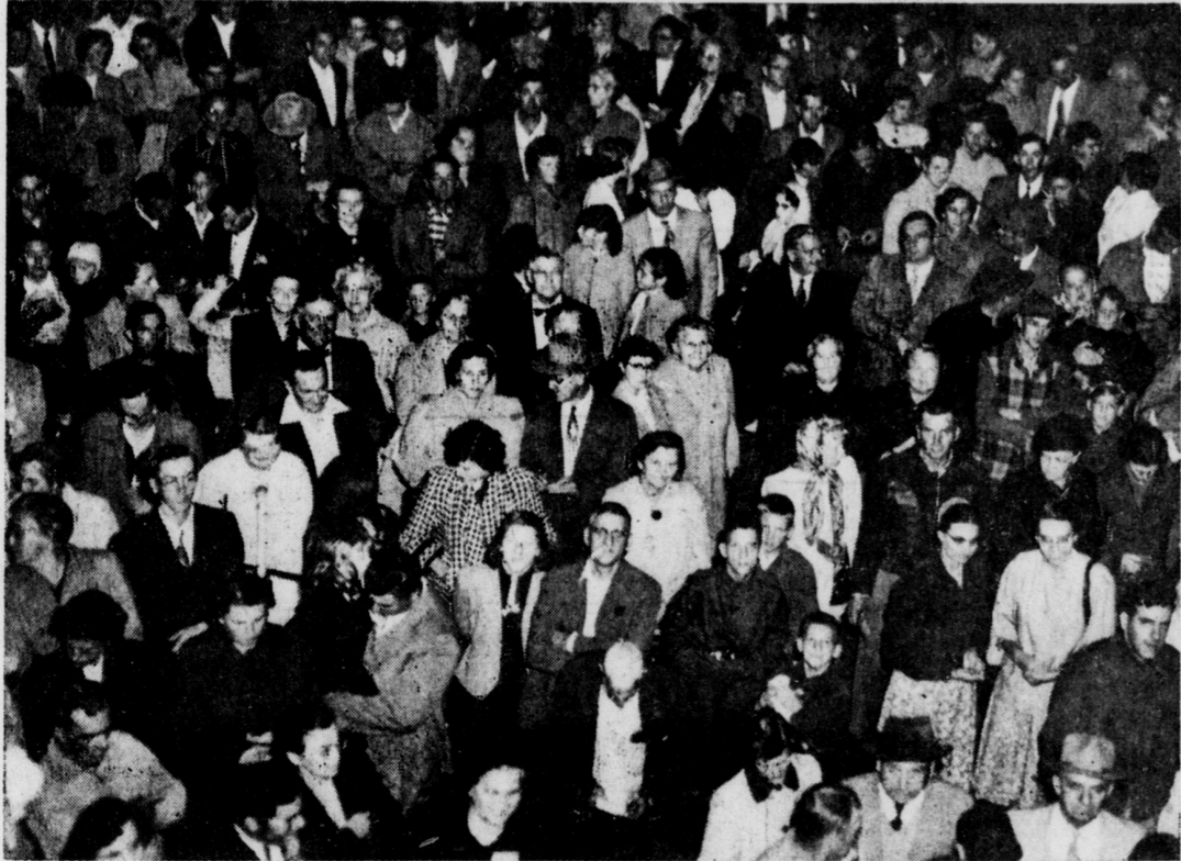
Part of large crowd at drawing for Merchants prizes Saturday night at fire house.