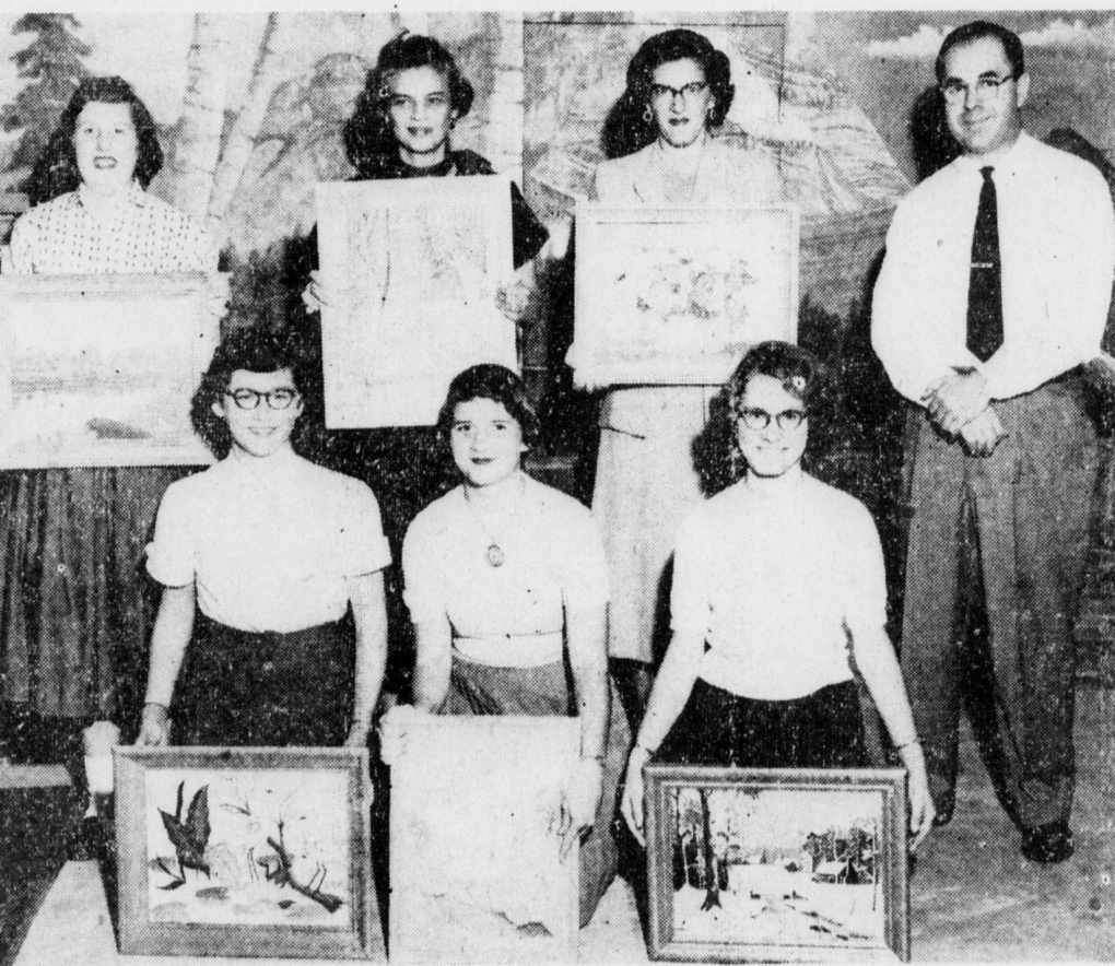
Exhibit Concludes Art Class Year; Prizes Awarded