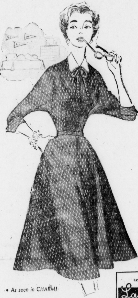
• As seen in CHARM!