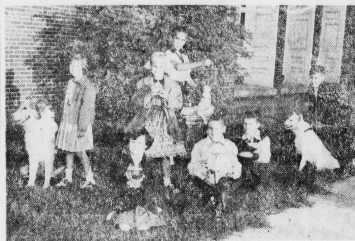
PET SHOW WINNERS: