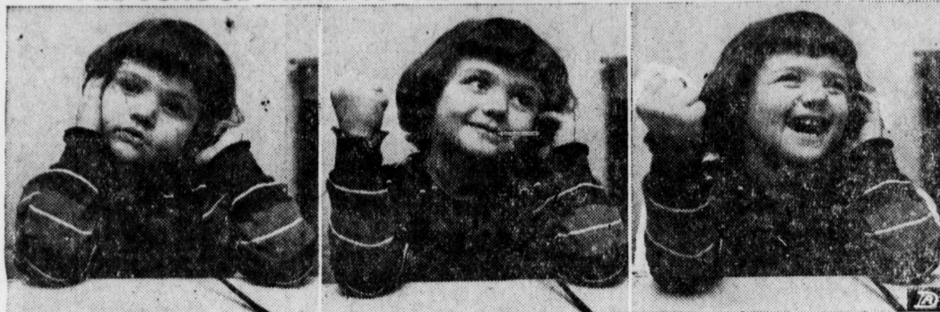
No sound . . . "I think I hear something" . . . "I DO hear!" . . .

These three dramatic pictures should remind parents this is the time of year to have their children's hearing tested before school opens in September. There are about two million children in the U.S. who suffer undiscovered hearing impairments, according to the American Hearing Aid Association. The non-profit organization urges parents to have their children's hearing tested by an ear doctor or reputable hearing aid specialist at the slightest sign of a hearing loss. It reminds parents to be especially alert since children often try to conceal hearing impairments because they want to be like other kids.