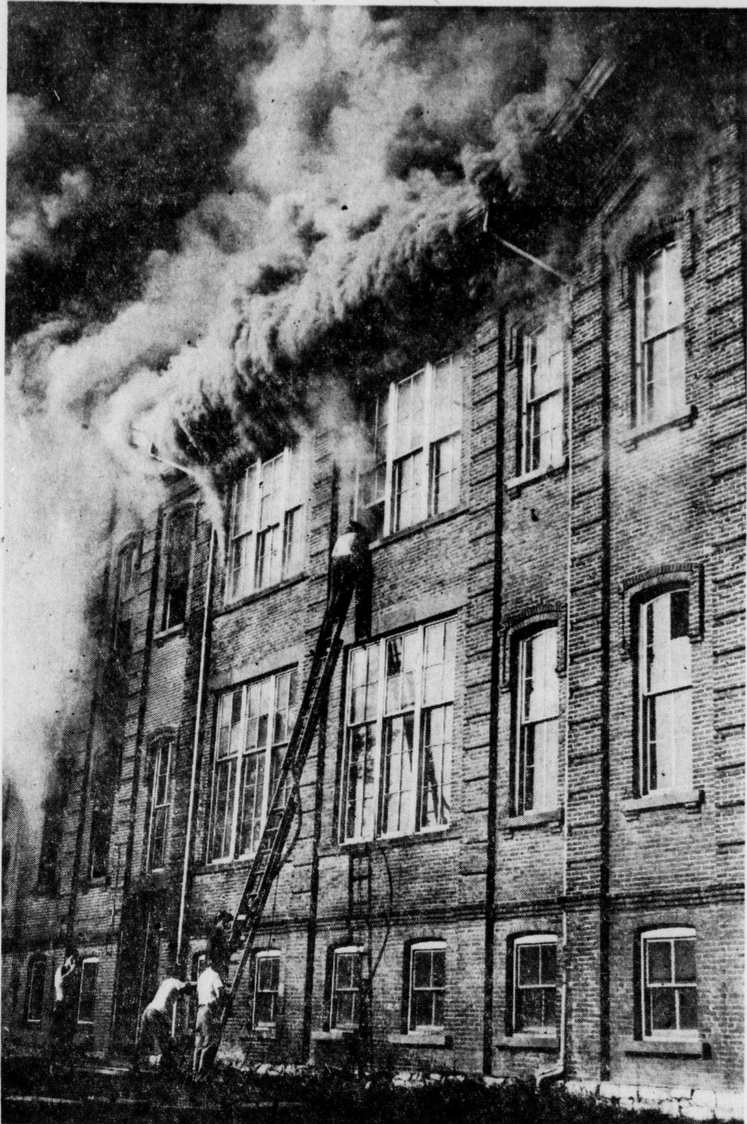
Minutes after the fire broke out in the grade school, it spread over the whole building and created a smoke-filled roof. (More Photos on Page 8)