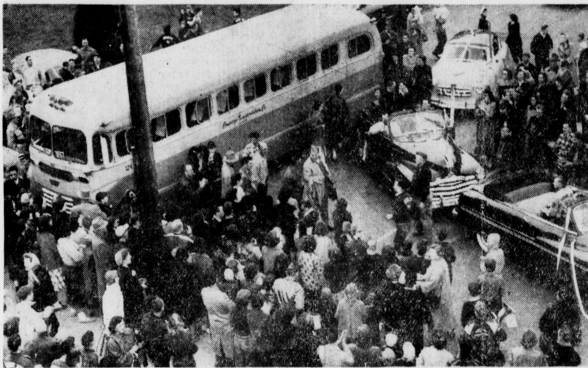
Cut Courtesy of Lanc. Sunday News

Upon arrival in Mount Joy after the state championship game, the team and coaches were loaded into convertibles to be given a welcome home celebration. Approximately 400 citizens were attracted to meet at the high school after a truck with a loud speaker asked them to come Saturday afternoon. A band played and seventy-five cars joined in the parade. The boys thought for a few moments that Mount Joy had not heard the final score of that famous game; but—Mount Joy had and they were and are proud of their champs!