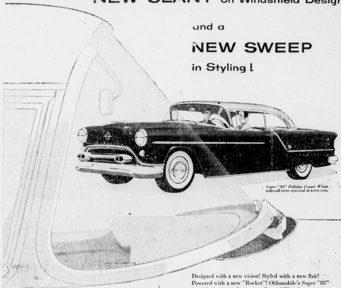
Super "88" Holiday Coupé. White sidewall tires optional at extra cost.

Designed with a new vision! Styled with a new flair! Powered with a new "Rocket"! Oldsmobile's Super "88" for 1954 is new— ultra-new —all over! There's a new lively look to its jaunty, wide-angle panoramic windshield—and new safety, too! Its new long, low-level silhouette sets a brilliant new high in fashion—a thrilling new pattern for the future! Sweep-cut doors and fenders give a new, dashing "sports car" flair to this spirited style star! That new high-level, full-width cowl ventilator means fresher, cleaner air! And underneath that long and lovely hood, there's World Record power—a flashing new 185-horsepower "Rocket" Engine with an 8.25 to 1 compression ratio! For a completely new view on modern motoring, see the completely new Super "88" for 1954—on gala display at your Oldsmobile dealer's now!