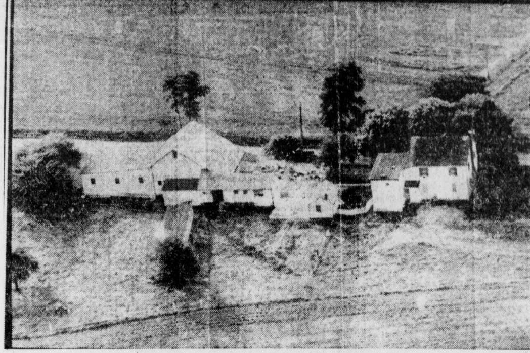
last week's paper. Can anyone recognize it? The owner will receive an enlarged photo in a frame and certificates of merchandise

In recent weeks, hardy Pennsylvania trappers have been investigating likely looking dams