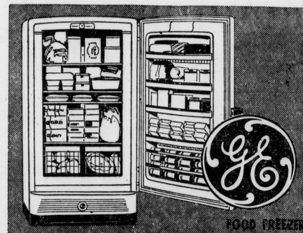
UPRIGHT FOOD FREEZER