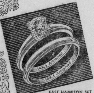
EAST HAMPTON SET