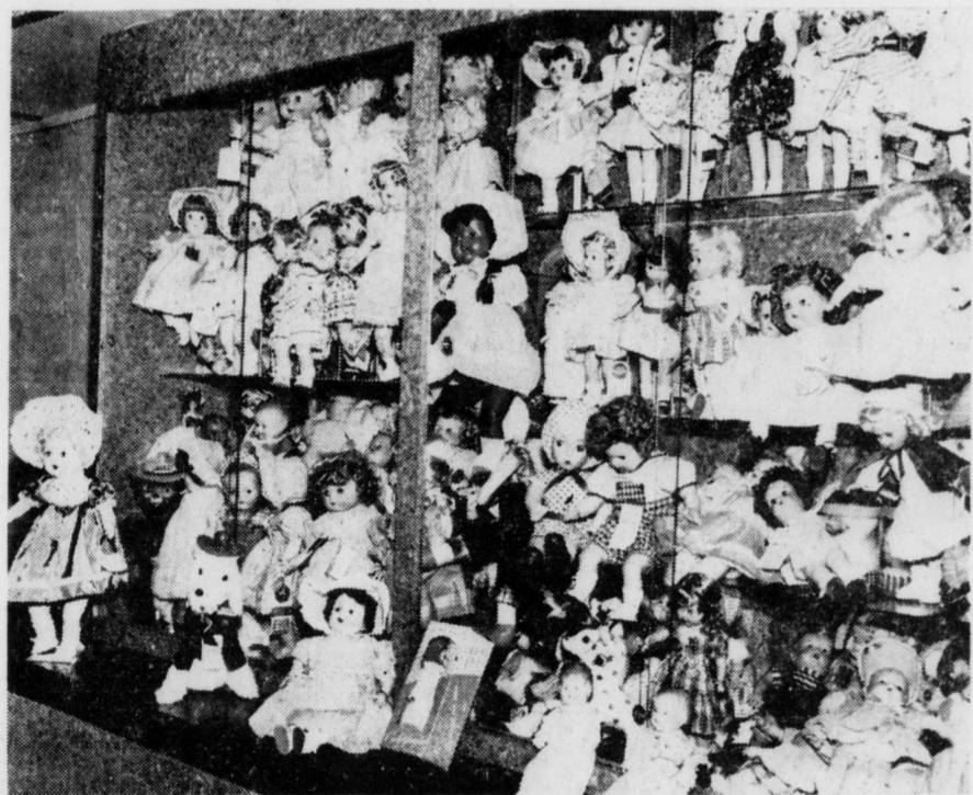
FOR THE GIRLS — FULL LINE OF DOLLS

Watch for announcement on dates he'll be here