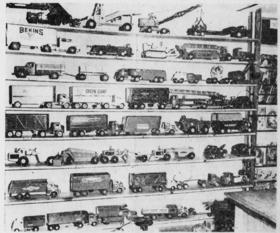
FOR THE BOYS — TRUCKS GALORE