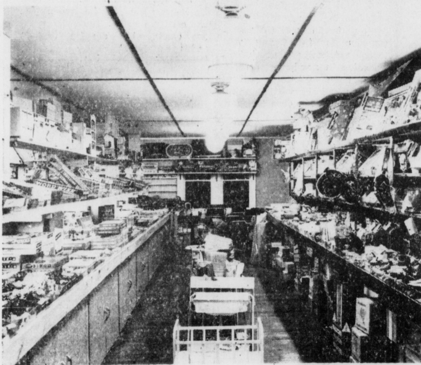
VIEW OF SECTION OF ENLARGED TOY CENTER

Our Toy Department is open all year as gift headquarters for all special occasions