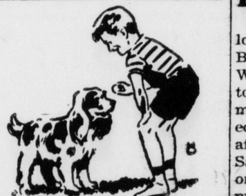
Can you guess this puppy's name? He will be given to the child who can guess his name at the Florin Branch Bank Openhouse.