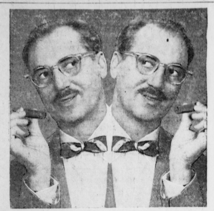
GROUCHO SAYS, "I've been beside myself since seeing the NEW 1954 DE SOTO. You'll see it on Nov. 5th at your De Soto-Plymouth dealer ... and tell 'em Groucho sent you!"