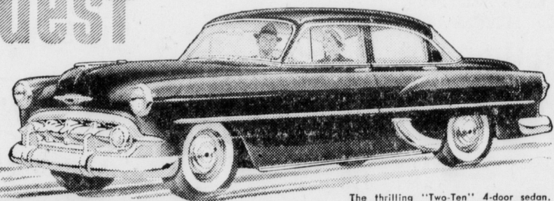
The thrilling "Two-Ten" 4-door sedan. With 3 great new series, Chevrolet offers the widest choice of models in its field.

Chevrolet BUYER-BENEFITS are the Soundest