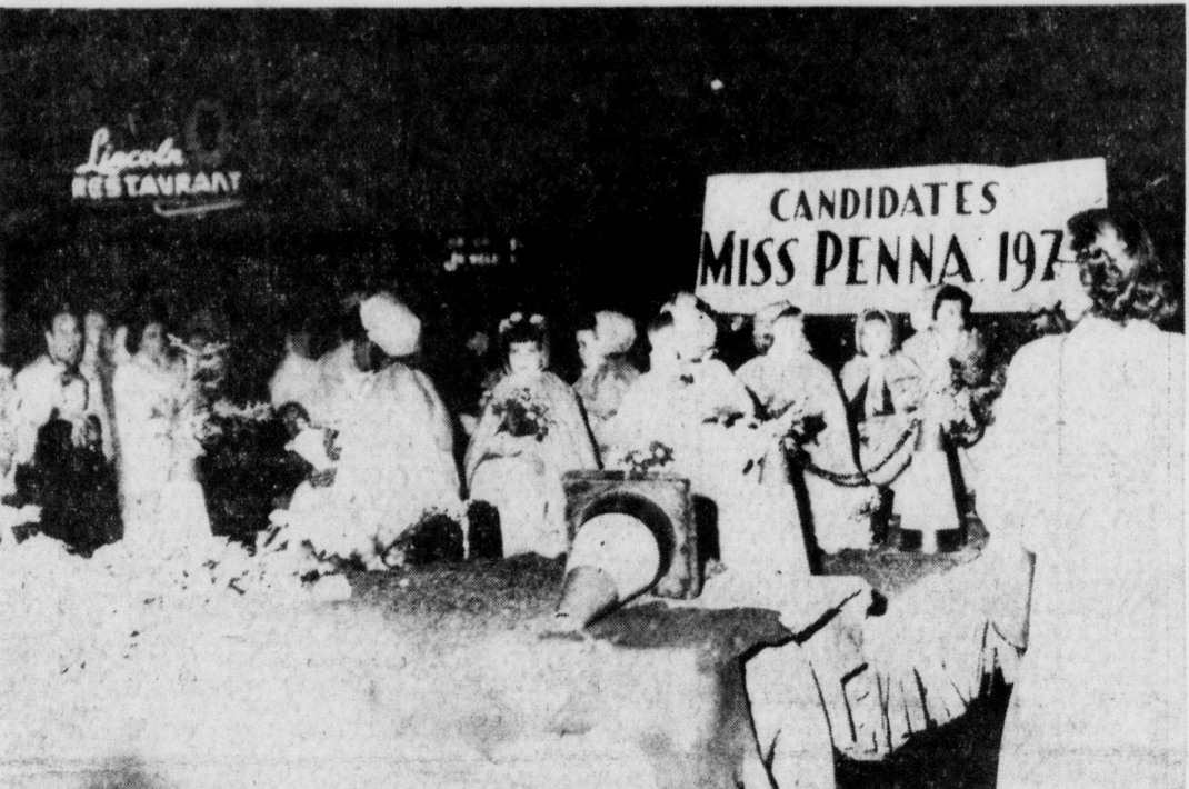
JoyCeers' float, "Miss Pennsylvania of 1970," first prize winner in organizations' class.