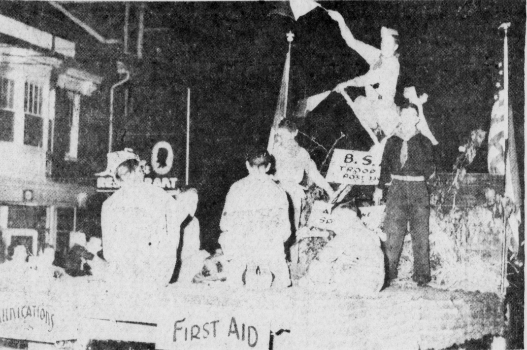
Boy Scout Troop 39 entered winning float in children's division.