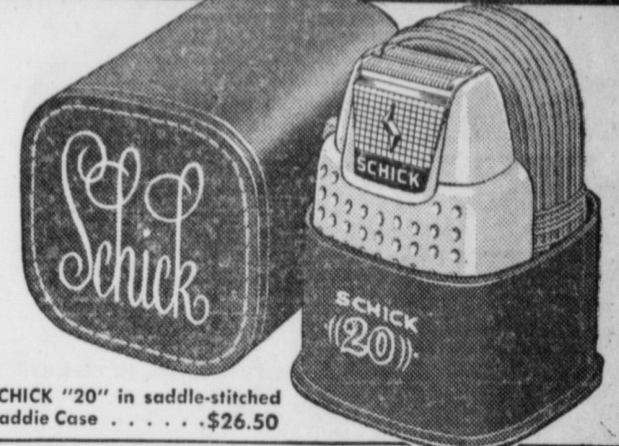
SCHICK "20" in saddle-stitched Caddie Case . . . . $26.50

MUST SHAVE YOU CLOSE - OR YOUR MONEY BACK!