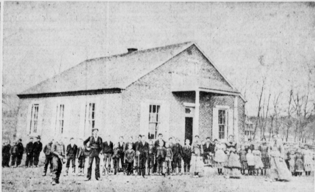
OLD TIME PHOTO—This is a reproduction of photo taken at Root school in 1876. On Saturday, Sept. 19, the school will celebrate the 100th anniversary of its erection.