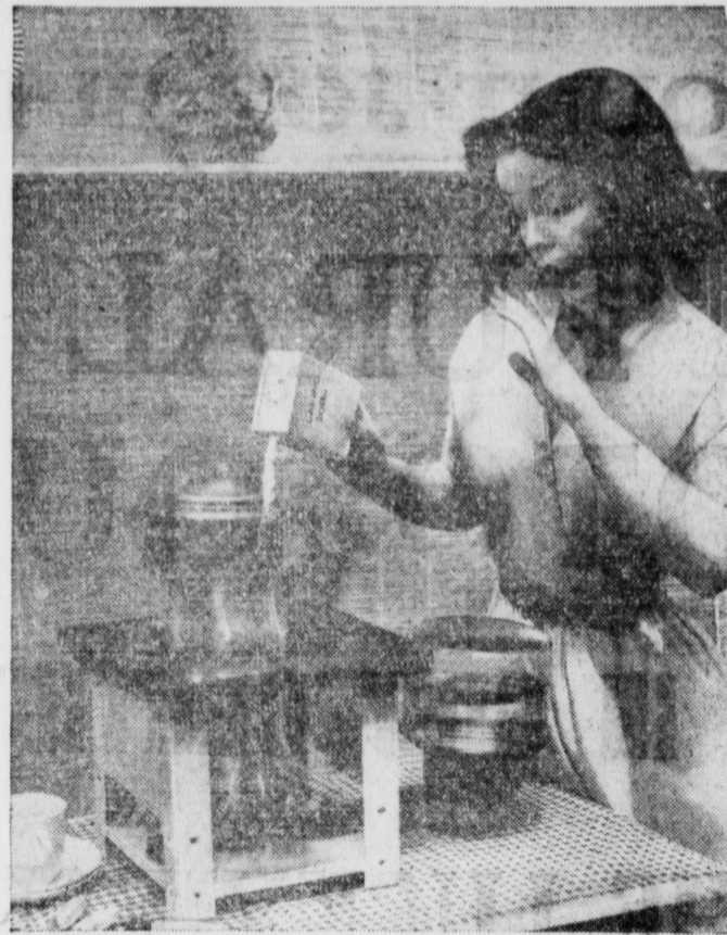
Because summer camps and cottages are often far from local fire departments, and since cooking and heating equipment is often improperly adjusted, fires are a big danger. Be especially careful during your stay in a vacation paradise. And keep a box of baking soda handy to the cooking unit; it's ideal for extinguishing grease fires quickly. Just sprinkle soda on the flames. It cuts off the oxygen supply, snuffs out the blaze.

the Trustees of the James Lick Trust for $250,000. At this time he also owned the area later to become known as Hollywood. His estate exceeded $5,000,000.