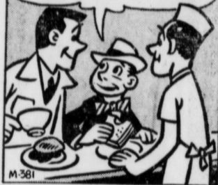
For full information contact your nearest VETERANS ADMINISTRATION office

POST-KOREA VETERANS SEPARATED FROM SERVICE BEFORE AUGUST 20, 1952, MUST START THEIR KOREA GI BILL TRAINING BY AUGUST 20, 1954, TO GET UNDER THE DEADLINE