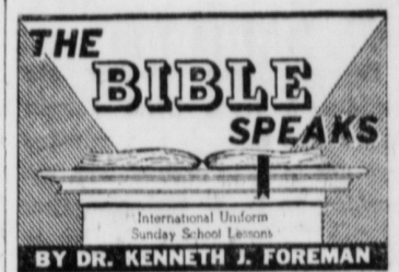
Scripture: Acts 18:23-21:14. Devotional Reading: I Corinthians 3:10-15.