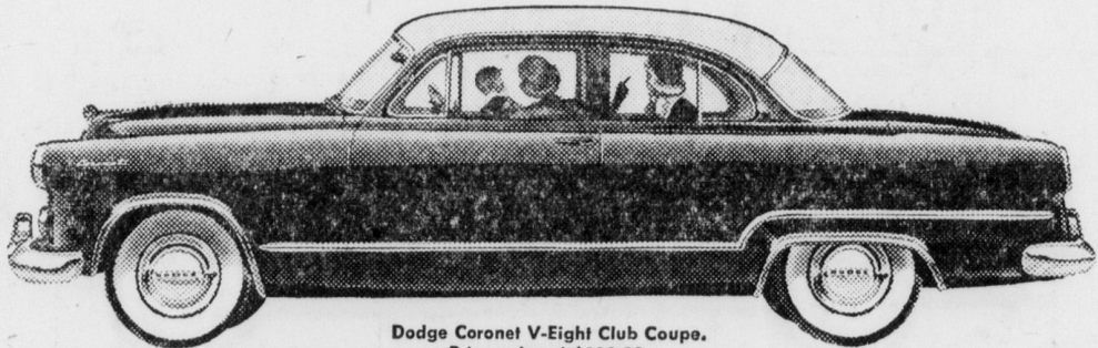
Dodge Coronet V-Eight Club Coupe. Price reduced $128.80

You are the winner! You get the savings as Dodge sales climb 50% and production rises to meet strong public demand. These across-the-board price reductions make Dodge the outstanding value of the entire automobile industry. Now is the time to step up to America's all-new Action Car.