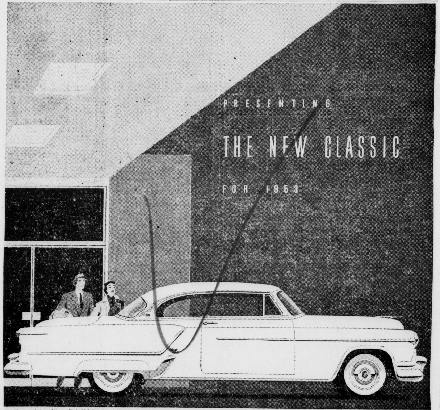
Car illustrated above: Ninety-Eight Holiday Coupé, New Super "88" for 1953 also now on display at your dealer's. A General Motors Value.

Member of Federal Deposit Insurance Corporation