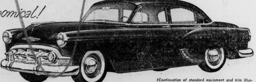
(Continuation of standard equipment and trim illustrated is dependent on availability of material.)

lowest priced of all quality cars! Smart new Chevrolet styling and advanced features! Five models include the 4-Door and 2-Door Sedans, Club Coupe, Business Coupe, "One-Fifty" Handyman.