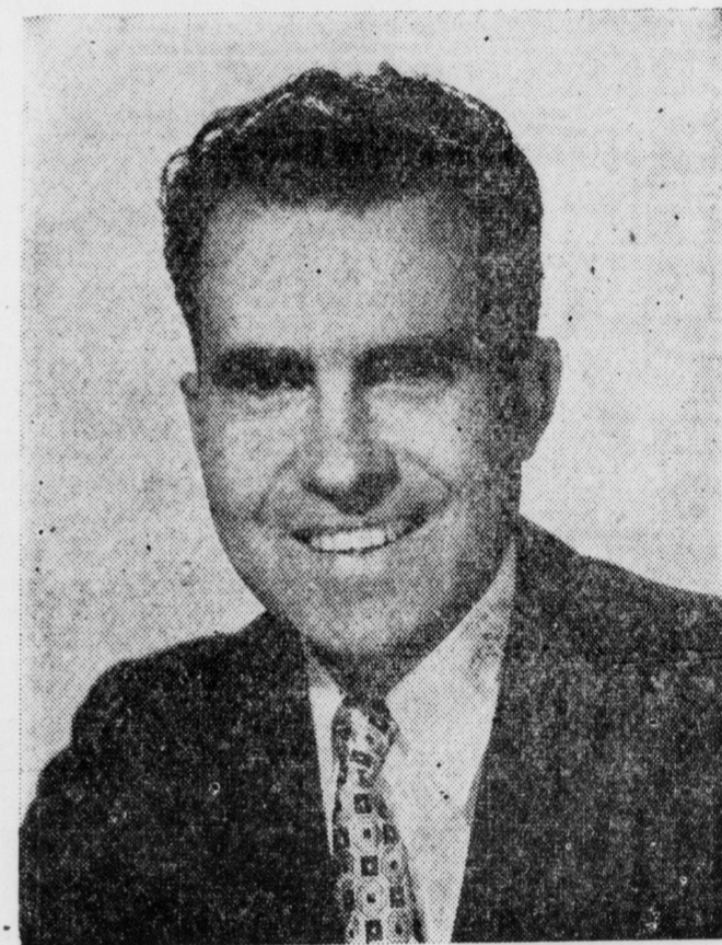
RICHARD M. NIXON