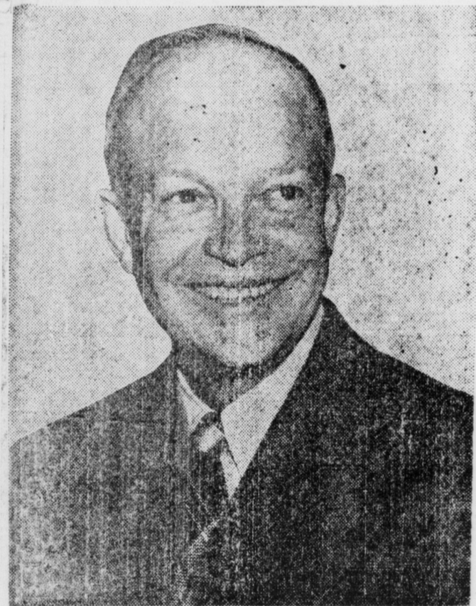
DWIGHT D. EISENHOWER