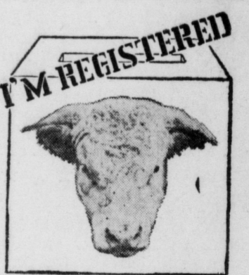
but can't vote... YOU Can!

Two thirds of the revenue that is received from the homes along the route will be turned over to the school for 14 years, and, at the end of that time, the Authority will give the water main to the Borough of Mount Joy at no additional cost.