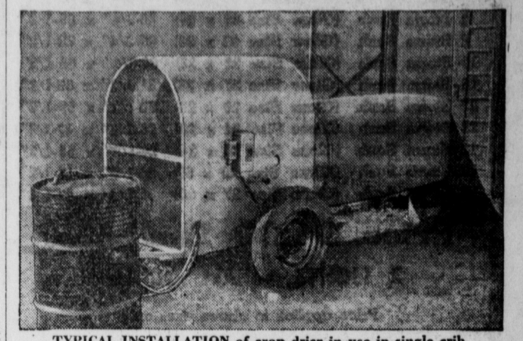
TYPICAL INSTALLATION of crop drier in use in single crib.

When heat is needed, there are crop driers available which can handle this job. Such units have built-in heaters and motor-driven fans, as well as thermostats and other controls to keep the temperature and air flow at correct drying levels. Both single and double cribs may be used for drying, provided a few