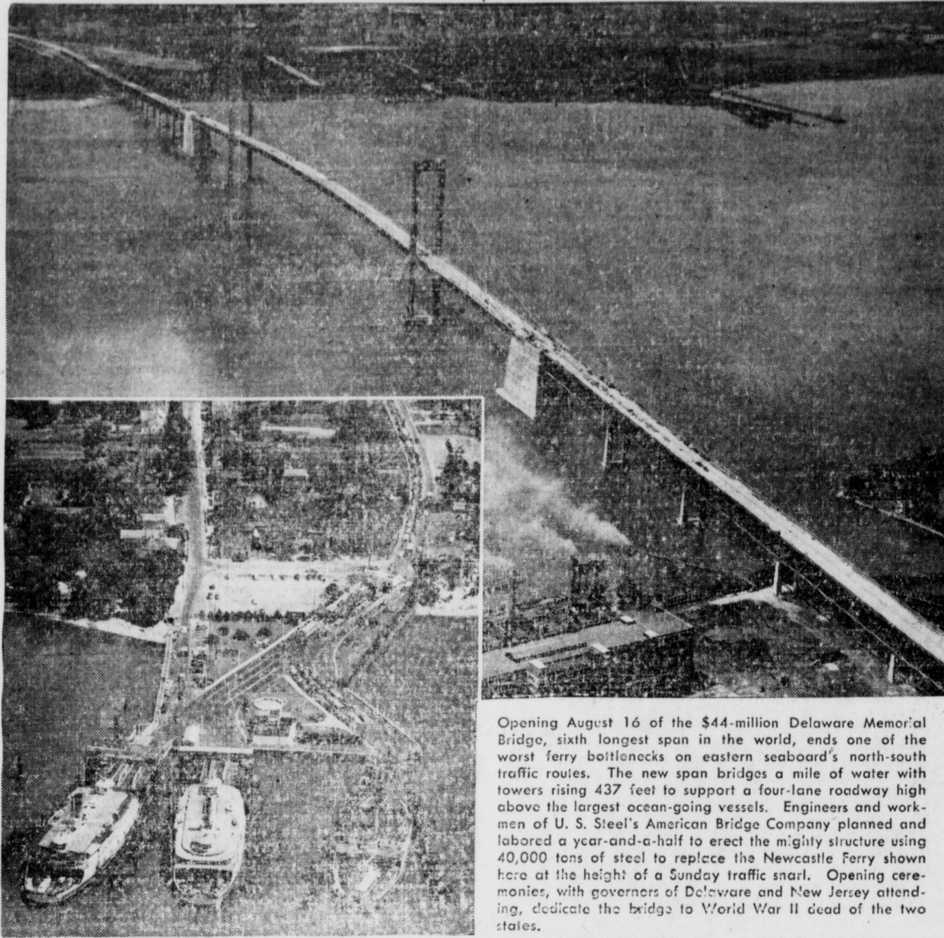
Opening August 16 of the $44-million Delaware Memorial Bridge, sixth longest span in the world, ends one of the worst ferry bottlenecks on eastern seaboard's north-south traffic routes. The new span bridges a mile of water with towers rising 437 feet to support a four-lane roadway high above the largest ocean-going vessels. Engineers and workmen of U. S. Steel's American Bridge Company planned and labored a year-and-a-half to erect the mighty structure using 40,000 tons of steel to replace the Newcastle Ferry shown here at the height of a Sunday traffic snarl. Opening ceremonies, with governors of Delaware and New Jersey attending, dedicate the bridge to World War II dead of the two states.

BAGGY PANTS Are Most UNSIGHTLY WE CLEAN AND PRESS them for you RIGHTLY