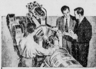
When you come to check the field you'll find that there's a sweat freedom from roughness to this engine's operation—tracing to the fact that the whole mechanism itself is engineered smooth, and the further fact that every Fireball Engine gets a Micropoise balancing after assembly.

So what gives us a chuckle is this: No other type of engine has ever been used in a Buick—which means that Buick owners, all along, have