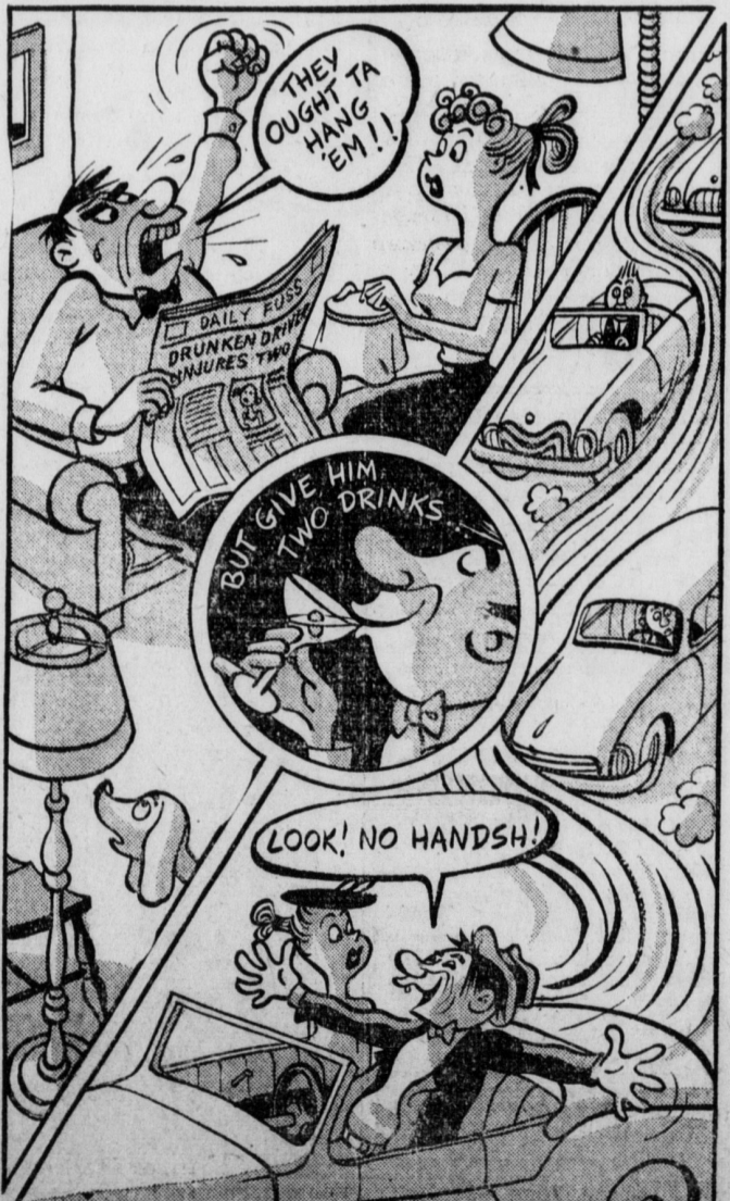
Travelers Safety Service