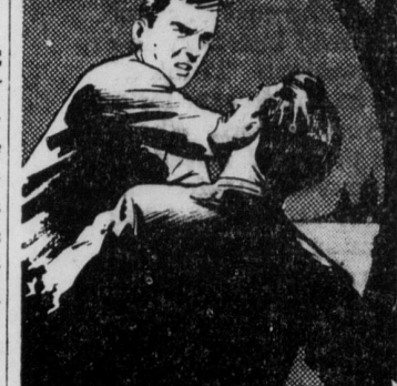
Clark's feet went out from under him. He fell groaning.

sounded along the pebbles. A figure loomed out of the gloom. Davis