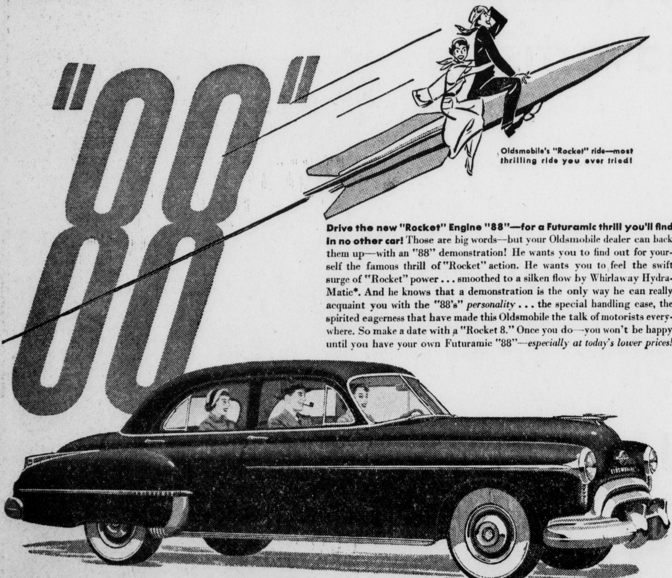
"Whirlaway Hydra-Matic Drive, at reduced price, now optional on all Oldsmobile models." A GENERAL MOTORS VALUE