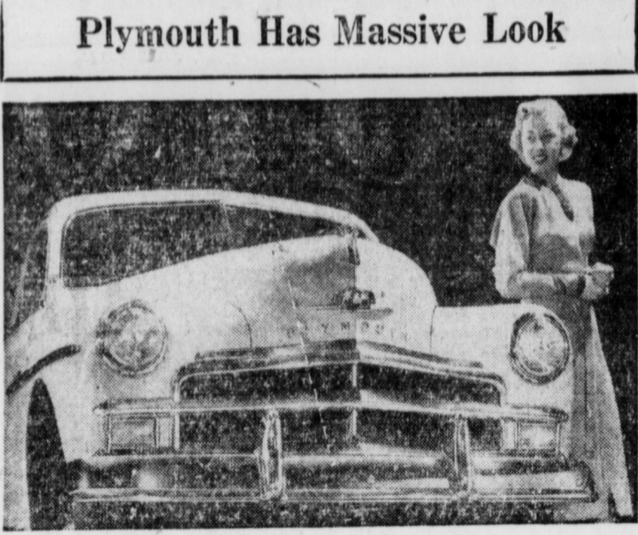
Plymouth Has Massive Look

STORE GARDEN TOOLS Be sure to clean and repair the garden tools and then store them where they will not get rusty by spring. Rubbing oil on metal parts prevents rusting.