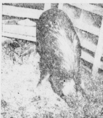
Here is shown a pig brooder in operation. Ofttimes some form of supplementary heat is necessary to prevent a high mortality rate among pigs. Pig brooders such as this have been developed for this purpose.

Are Found Valuable At Farrowing Time "This little pig went to market" . . . is a great first line for a nursery rhyme. But it doesn't go far enough as far as farmers are concerned. They'd rather wait until the pig grows up before sending it to market. And the growing-up process is no snap, especially during the first few weeks when the old sow may crush her precious offspring as they crowd around her in an effort to keep warm. The problem of getting hogs to