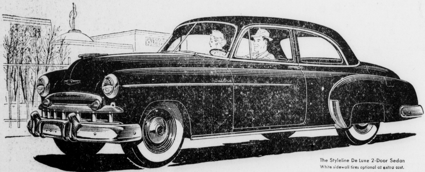
The Styleline De Luxe 2-Door Sedan White sidewall tires optional at extra cost.

Your first thrill is seeing it... Your greatest thrill is driving it!