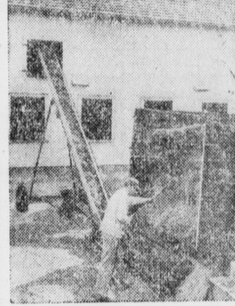
root crops, shelled corn, ground grain and forage. Chopped hay is being elevated in the accompanying illustration.

All-purpose elevators, either portable or stationary, are capable of elevating to desired heights baled, chopped or loose hay, ear corn,