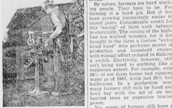
WHILE THEY WORK—Farmers are planning for 1949.