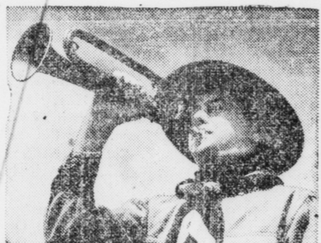
YOU'LL FEEL GOOD because you'll know you've helped our youngsters... the youth services that develop citizenship, character, health, and open up new adventurous worlds to youngsters.