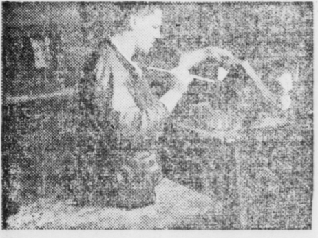
YOU'LL FEEL GOOD because you'll know you've helped the crippled to overcome handicaps... to make themselves reliant and self-supporting, to find a useful, happy place in the world.