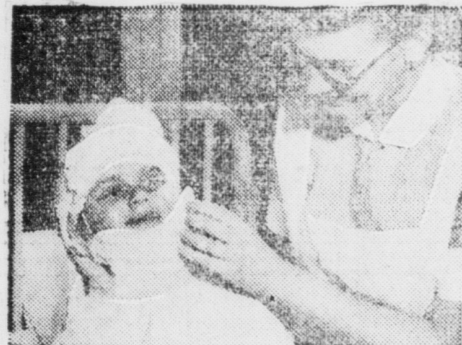
YOU'LL FEEL GOOD because you'll know you've helped the hospitals and the clinics... because you've helped the visiting nurse services keep up their blessed work of health and healing.