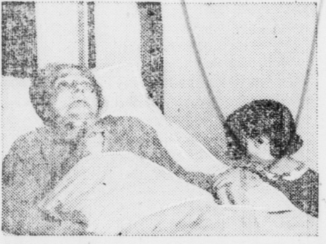
YOU'LL FEEL GOOD because you'll know you've brought kindly care to the aged... and that your dollars have helped family services keep many a home from breaking up.