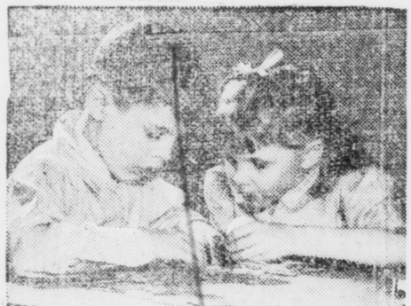
YOU'LL FEEL GOOD because you'll know you've helped keep open the doors of day nurseries and foster homes where orphaned or neglected children find shelter and love.