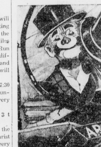
As he looked at himself in the mirror he forgot everything.

Arsel had the old suit on now. He wondered again what made him feel so strange. But then as he looked at himself in the dingy mirror he