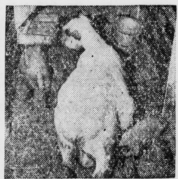
Well-conditioned ewe that should cause no trouble.

Feed bunks for cattle should be 30 inches high for mature stock and 20 inches for calves. Allow 30 inches of trough length for each grown animal, 20 for each calf. Make the grain and silage bunk three feet wide for feeding from both sides.