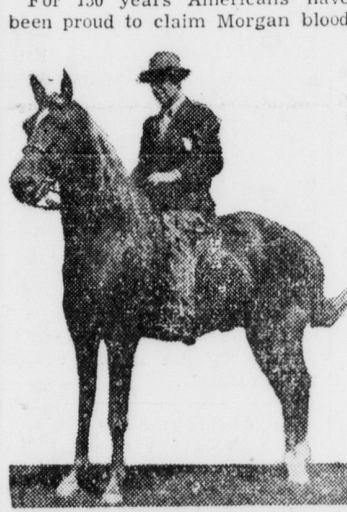
Good example of a Morgan horse.

For 150 years Americans have been proud to claim Morgan blood in their horses. It implied energy, courage, bottom and excellent saddle horse. The breed is being perpetuated at the United States Morgan Horse Farm, Middlebury, Vt.