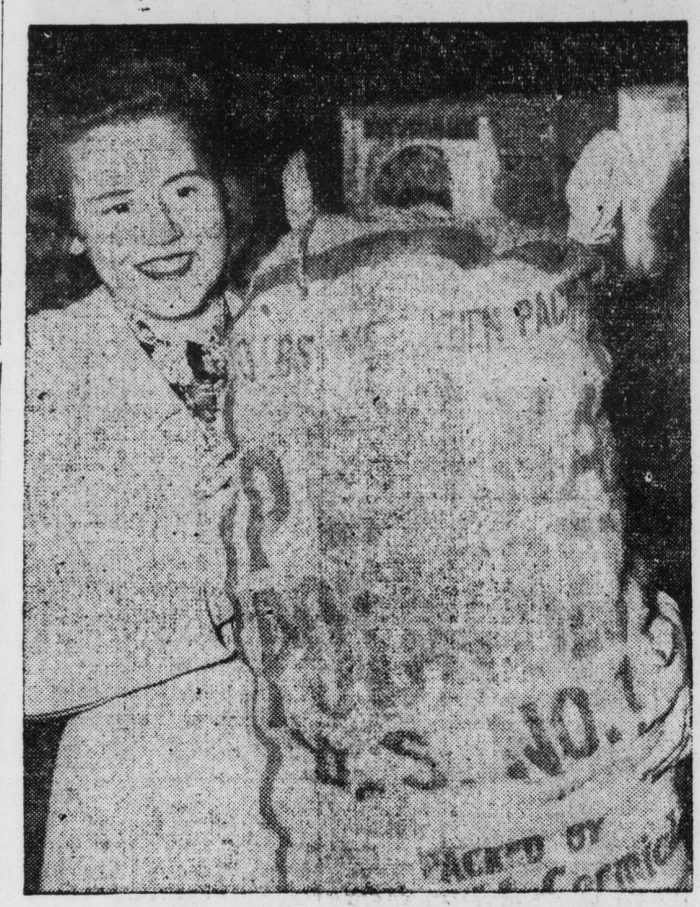
PENNSYLVANIA STATE PMA COMMITTEE

USE MORE POTATOES SAYS PENNSYLVANIA QUEEN