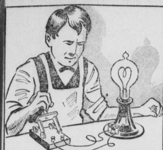
1879 - THE GREATEST ACHIEVEMENT IN THE HISTORY OF ELECTRICITY WAS WHEN THOMAS A. EDISON MADE THE FIRST SUCCESSFUL LIGHT BULB!