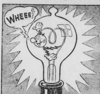
WHEN EDISON TURNED THE SWITCH REDDY FLASHED INTO ACTION. HE CHARGED UP & DOWN THE WIRES 'TIL THEY WERE RED HOT-THE BULB LIT UP!