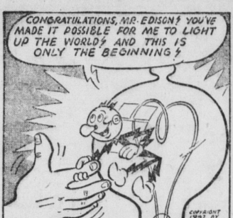
CONGRATULATIONS, MR. EDISON! YOU'VE MADE IT POSSIBLE FOR ME TO LIGHT UP THE WORLD! AND THIS IS ONLY THE BEGINNING!