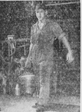
Ideal Dairy Layout

Conclusions reached from the tests also showed that the temperature of the water was not nearly so important as the temperature of the air. In other words, if the cow had to stand outside in near zero weather, she was likely to drink