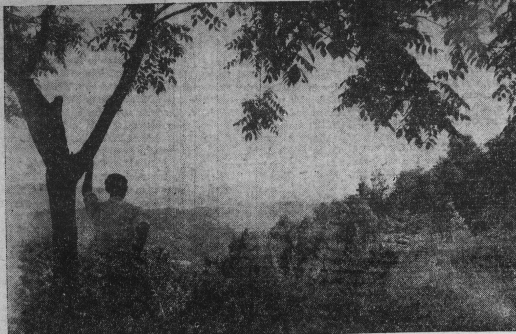
Framed by trees, one catches this glimpse of the quietness and peace of the Pennsylvania mountains. Here a man relaxes, even if but for a brief time, from the exacting duties of the war effort.