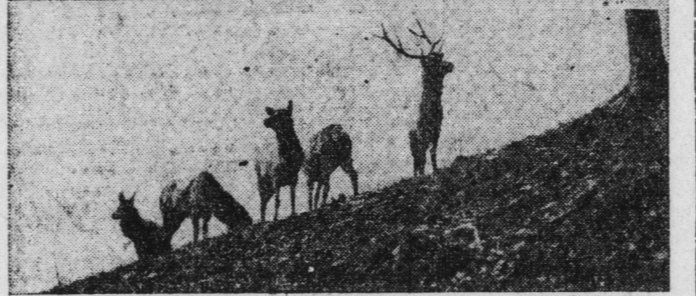
Largest herd of buffaloes east of the Mississippi is one of the features of the Trexler-Lehigh County game preserve near Allentown. New roads through the large preserve make it easy for visitors to see many different forms of wild life, including large herds of deer and elk.