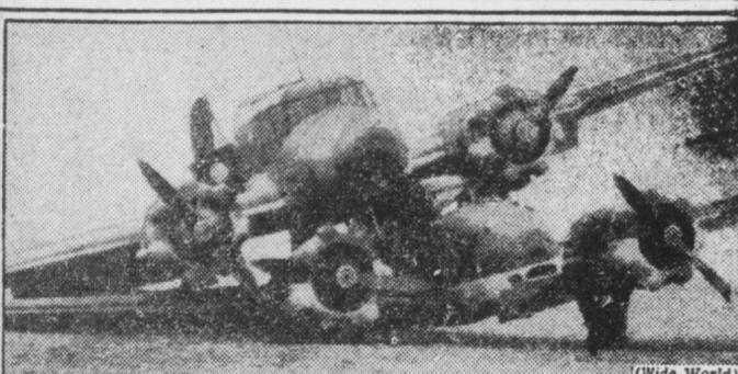
PICK-A-BACK CRASH . . . Two Royal Canadian Air Force student pilots brought their planes down thus near MacLeod, Alberta. They collided 50 feet above ground and became interlocked. Pilot "on top" shut off his motor and rode in so safely, neither pilot was injured.