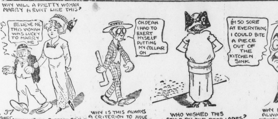
INTERNATIONAL CARTOON CO. N. Y. FASHIONS BY?