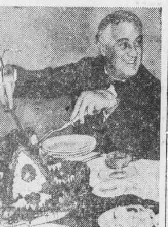
President Madison proclaimed four Thanksgiving days—all in different months. Other Thanksgivings have been observed in July, April, May and October.